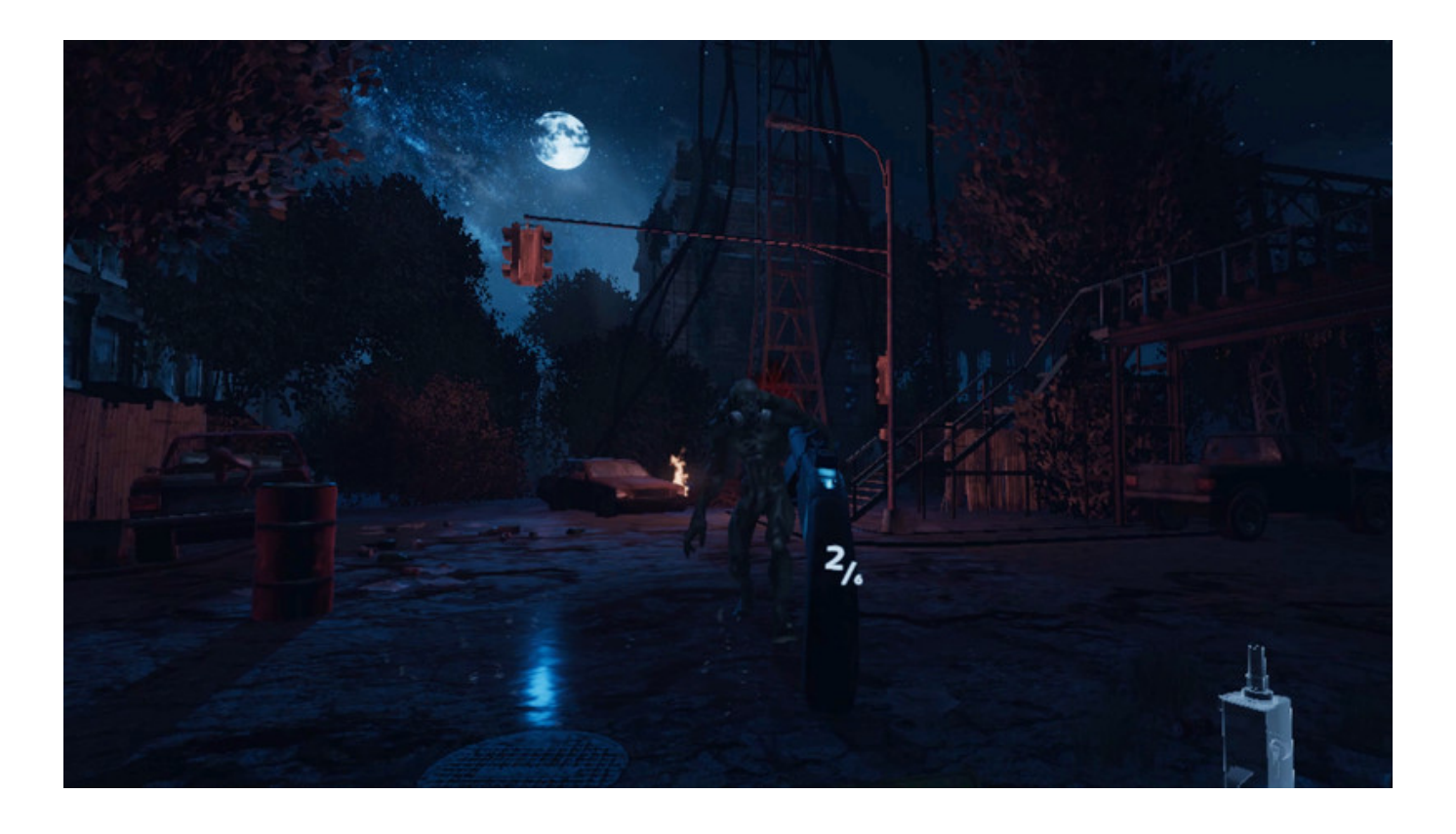
RPG Maker VX Ace - Community Resource Pack 32 Bit Crack